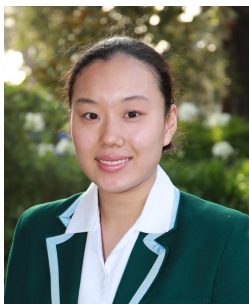
Student Leaders 2020