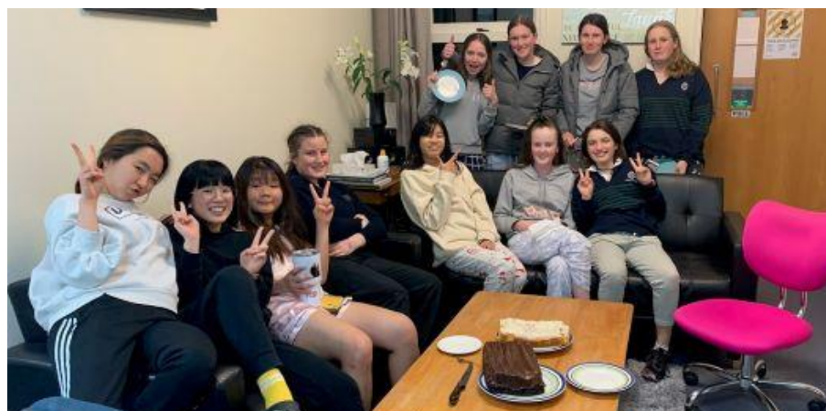
Boarders enjoyed a warm cake supper over our games night last Friday.

Please deposit money into bank account number: 01 0886 0011218 000 by 31 st July with your name and B/Parents dinner as a reference.