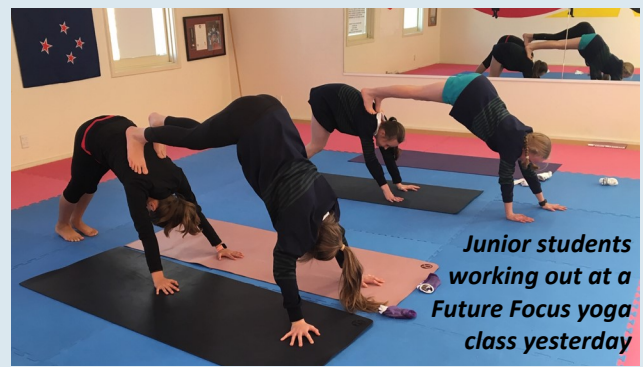
Junior students working out at a Future Focus yoga class yesterday