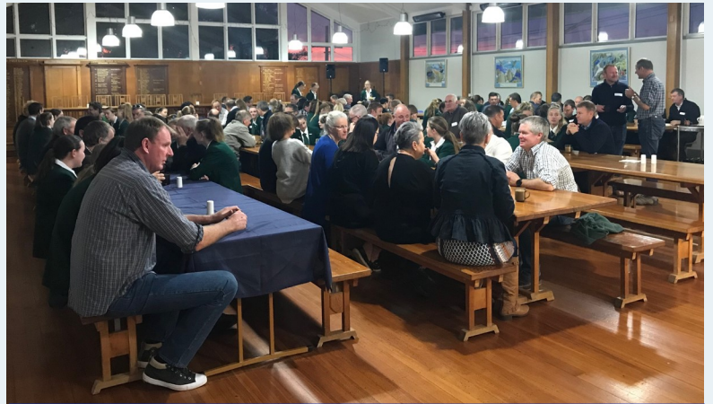
150 fathers and daughters attended Monday's Blokes Breakfast in the School dining room—many thanks to the kitchen and boarding staff for supporting this wonderful opportunity.

Day Three of the conference on Wednesday coincided with the nationwide industrial action undertaken by all sectors of New Zealand education. We were very fortunate that the Minister of Education, the Honorable Chris Hipkins, made the time to address the conference, answering our questions fully and honestly, on what would have been a very busy day for him. It looks as if there is no easy or immediate solution to the current pressing issues around workload, remuneration and teacher supply.