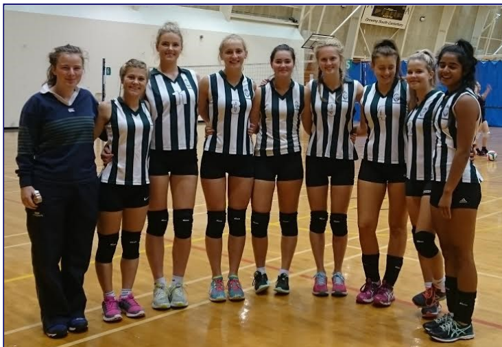
AORAKI SECONDARY SCHOOLS' VOLLEYBALL TOURNAMENT Senior A Team—placed 5th overall